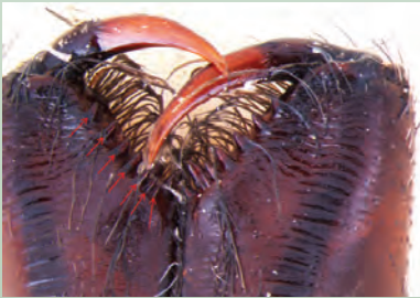
The arrows point to the six to eight teeth which can be found on the cheliceral retromargin.

There are several similar-looking species that also show up commonly in Bozeman houses, close relatives of the hobo spider. These include the giant house spider (an even larger spider that actually kills and eats hobo spiders) and the barn funnel spider.