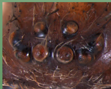
The hobo spider has eight eyes arranged in two nearly straight rows.

leaving their webs to look for mating opportunities. Hobos are big spiders with long legs and great sprinting skills. During most of the year they live fairly quietly underneath baseboard heaters or in cluttered corners in a low area of a basement room, but if you live in a basement apartment you can expect to see them moving around fairly regularly, even when it's not mating season.