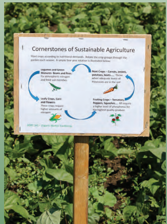
Educational sign explaining crop rotation for the HORT 345 Class Garden