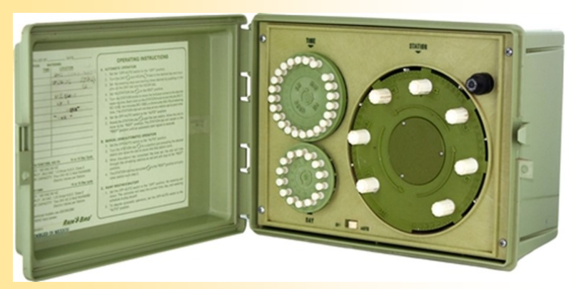
My irrigation controller is really outdated and inefficient.