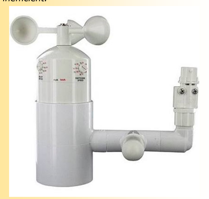
Irrigation weather stations are now around $150.

professionals to do water audits. You can even do a DIY audit using the procedures outlined in this document from the City of Bozeman. <a href="https://www.bozeman.net/Home/">https://www.bozeman.net/Home/</a> ShowDocument?id=5283