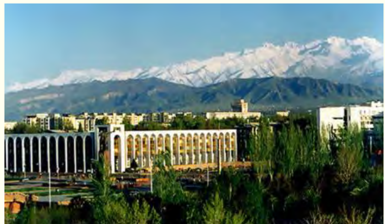
View of Bishkek and Tian Shan Mountains – elevations to 20,000 feet.