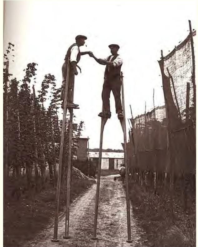
Many Thanks to Roy Lambeth, Edinburgh Scotland for the photo of Hops pickers / stringers. (Hops is used to flavor beer!)

Work in the hopyard continues as we weed and train the vines up the trellises. Future work will include placing signs to designate the varieties and building stand-alone trellises to demonstrate small backyard hop growing systems.