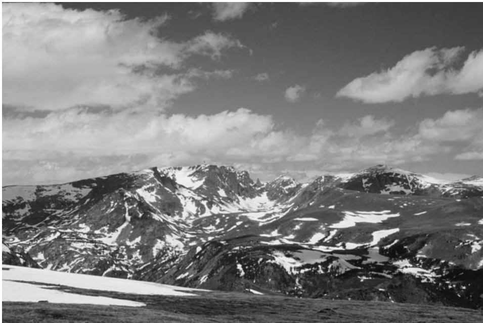
FIGURE 1. Panorama of the Beartooth Plateau alpine zone in the Northern Rocky Mountains, U.S.A.

and moist until processing. To observe fungi, roots were cleared by simmering in a 10% KOH solution for 3 min, rinsed in tap water for 20 min, simmered in a 5% ink and vinegar solution for 3 min., and rinsed in tap water for 5 to 10 min., following a technique from Vierheilig et al. (1998). Roots were examined under a dissecting scope for ectomycorrhizae and possible colonization of endomycorrhizae. Selected root lengths were mounted on microscope slides and examined under a compound microscope for infection. Levels were not quantified in detail, but particular roots were visually assessed for the extent of mycorrhizal colonization relative to the total root length. If diagnostic hyphae or other mycorrhizal structures were present in a few areas, it was considered lightly infected (+), twice that was considered medium (++), and if a majority of the root was colonized, it was considered a heavy infection (+++). Semipermanent slides were made of infected roots using glycerol as a mounting medium and nail polish to seal edges. These are housed in the MONT Herbarium at Montana State University with dried plant vouchers.