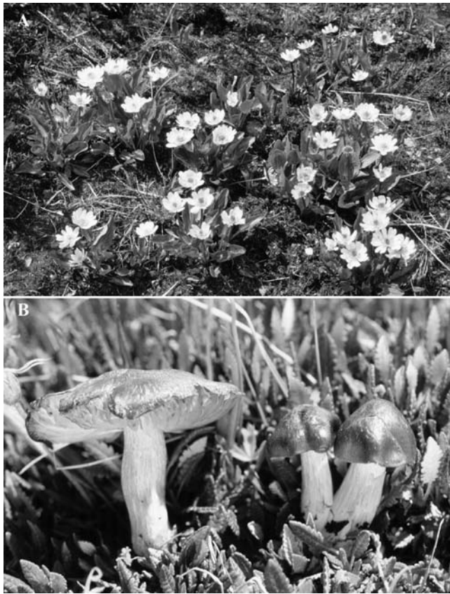
FIGURE 3. Organism level symbiosis. (A) Caltha leptosepala hosts arbuscular mycorrhizal fungi in its roots. (B) Dryas is ectomycorrhizal with mushroom-producing fungus Entoloma alpicola .