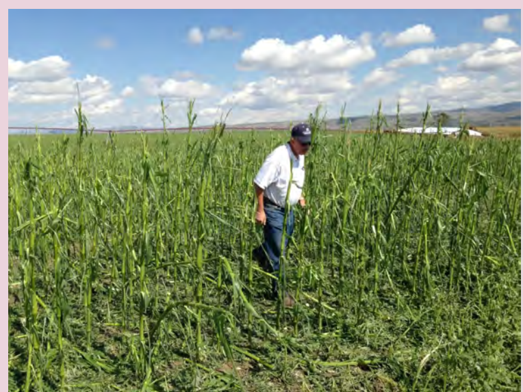
Barry Jacobsen evaluating the damage to field of Silage Corn.