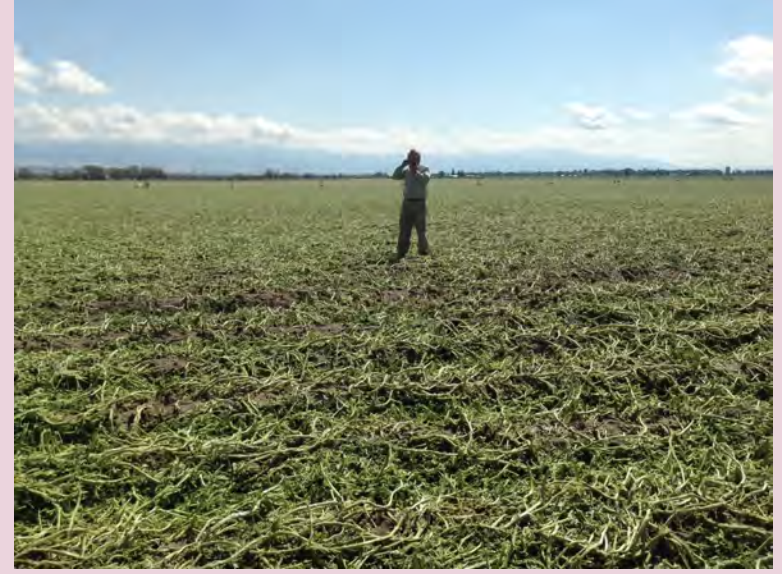
Nick Schutter standing in a potato field with 100% defoliation.

The repercussions of this storm will be felt by Montana seed potato growers and our customers in neighboring states for at least another two years. The yields on the early generation potatoes that are used to plant