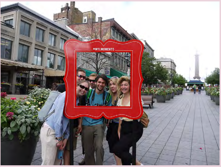
Old Montreal.

During the trip, students were required to seek a new experience beyond our time in class together. Allowed the opportunity to try something new and unique in Montréal, their cultural experience could take many forms: food, music, theatre, art or historical museum, architecture, or shopping. Shared in a written and visual exposition, students described their unique cultural exploration and phenomenological experience of who, what, where, when, and why their exploration felt "very Montreal" and what they took away from the experience. The general parting sentiment and noticeable theme was the description of Montréal as a place weaving "the old with the new," an irresistible balance of history with contemporary life.