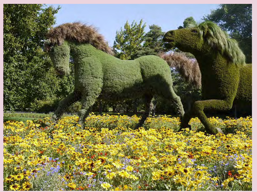
Mosaicultures Internationales Montreal at the Botanical Garden.

understand the concept and benefits of botanical gardens.