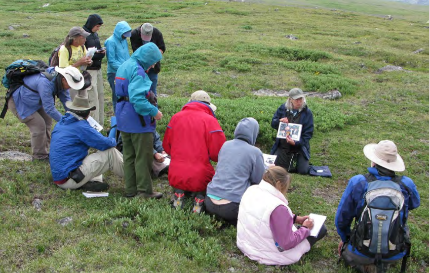
Wyoming Native Plant Society.

Later in July, I led a mushroom foray for the Wyoming Native Plant's Society on the Beartooth Plateau. While the alpine mushrooms are too small to consider for the frying pan, they are a unique consortium of species most closely related to those in the Arctic. They tolerate cold, a short growing season, drying winds, and high UV light. Attendees got out their hand lens to view the