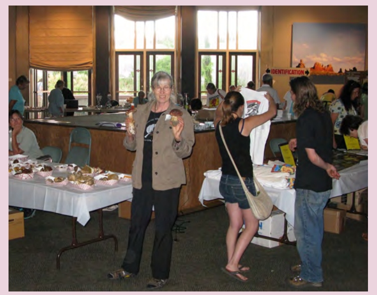
Denver Mushroom Fair.

kind of 'Dying with Mushrooms' involves learning how to dye yarn with extracts from various species. Or how about learning to make paper or felt from fungi? Mushroom artwork, books, and even clothing were on display. Many families attended as did experienced collectors and the merely curious. My job was to identify as many species of fungi as possible in 15 hours. This year, the total was 175 species and 30 were new to the Fair. That's one every five minutes! The event was capped by my talk on 'Riparian Mushrooms" presented to the Colorado Mycological Society which boasts 150 members. I was also able to visit the ancient Bristlecone pines (several