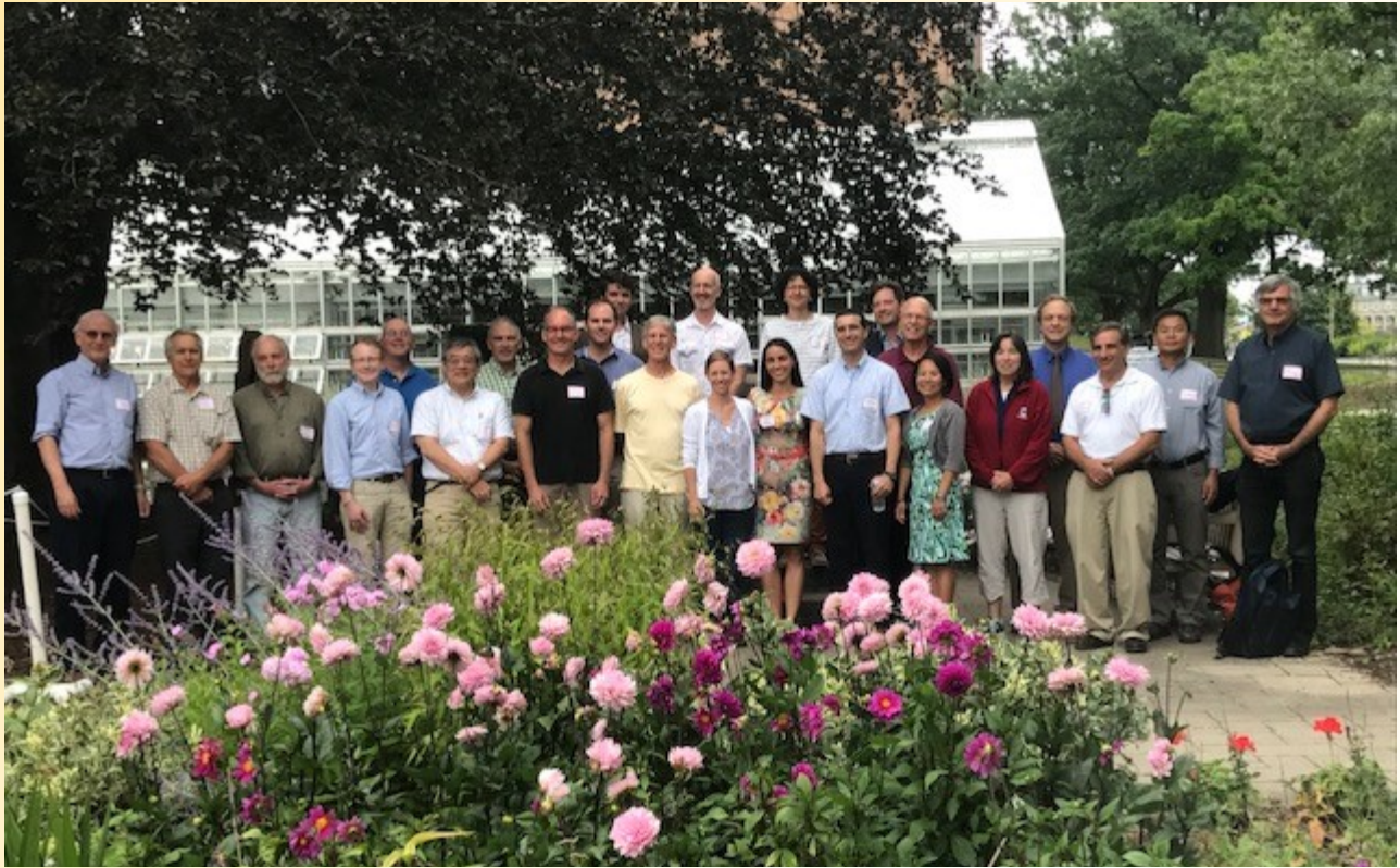
Participants at the Plant Pathology Symposium at Cornell University.

Following the main symposium, participants went on a tour of the area including the Buttermilk Falls Gorge, the Americana Winery and Brewery (including their vineyard and hops yard) and the Knapp Winery. Sadly, it ended too soon but everyone left having lots of new ideas and wonderful memories.