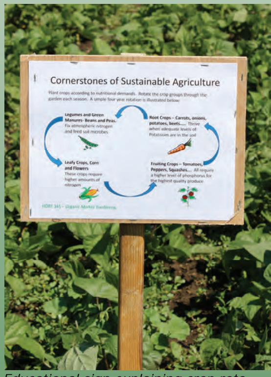
Educational sign explaining crop rotation for the HORT 345 Class Garden