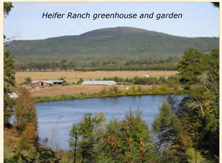
Heifer Ranch greenhouse and garden

Heifer International is a nonprofit development organization dedicated to improving communities through sustainable agriculture. Most notable for the use of livestock and "The Passing of the Gift", Heifer has projects in 58 countries/provinces and 27 states.