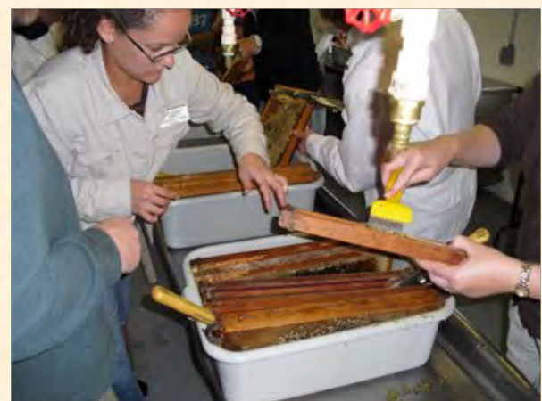
Uncapping frames of honey

and processing the Ranch's honey crop from ten honey bee colonies and preparing them for winter. Classroom time was mixed in to teach