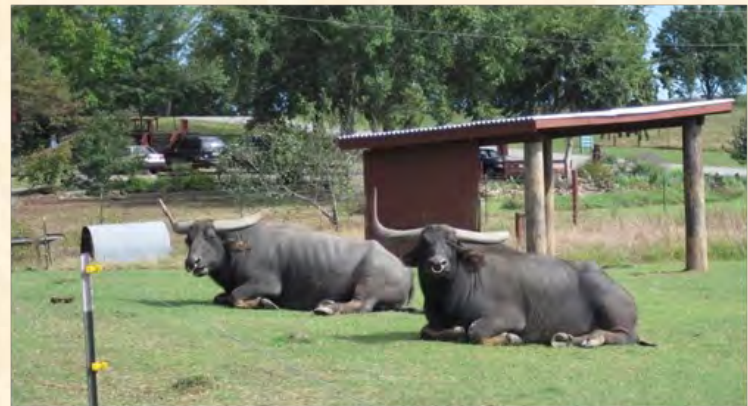
'Briggs and Stratton' resident water buffalo

The Heifer ranch, located in Perryville, Arkansas, is the home of many of Heifer's educational programs. I traveled to Perryville to assist with the fall beekeeping class "From Bees to Honey" offered October 4-8. The participants were hobby beekeepers and Heifer supporters that hailed from California to New Hampshire. Our work focused on harvesting