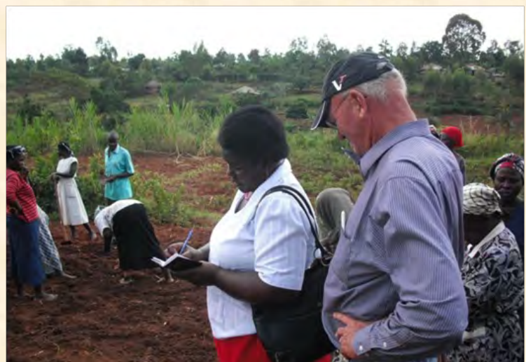
Watching over the field work to install the inoculums for the biological control agent in the field.