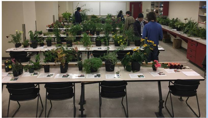
Students learn over 160 herbaceous plants common to most garden centers.

Today was the final for the Horticulture 232 Herbaceous Identification class at the PGC. Thirty students spent hours studying for the final which consisted naming and correctly spelling the common and scientific names of 50 annuals, perennials, ornamental bulbs and houseplants. The students learned over 160 plants in total, which is compiled from a list of common plants found in the garden center, landscaping and nursery industry. This year's students were exceptional! Congratulations!