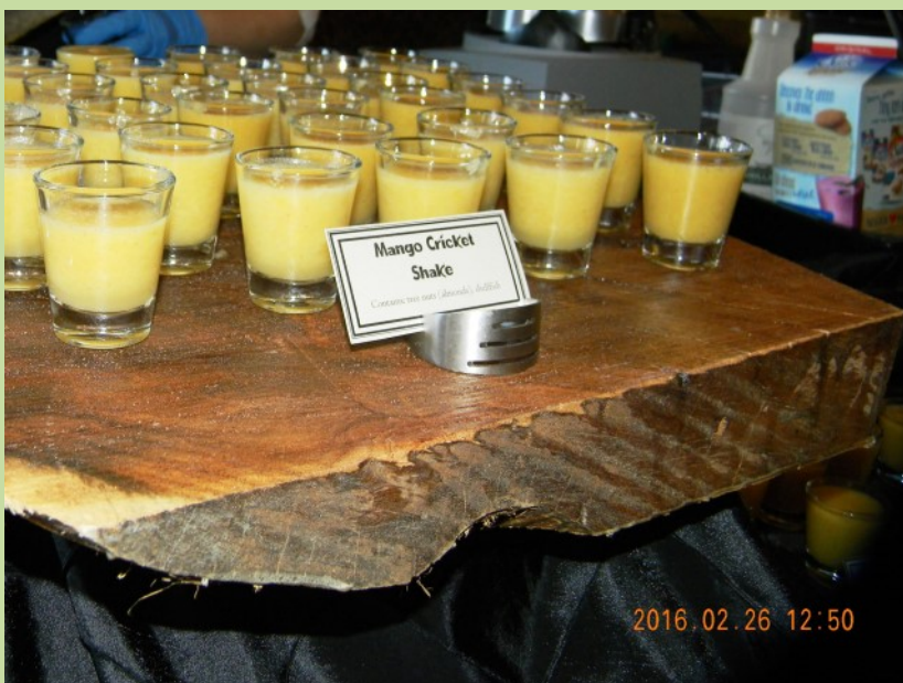
Cricket powder produced by Aspire, Texas food cricket farm, makes high protein mango smoothies, the all-time MSU favorite.

We learned from Toews how to normalize edible insects for the Euro-American palate. We shared figures of the environmental footprint of over 2000 species of food insects versus the several species of vertebrates that became major sources of protein for Europeans and Euro-Americans. We pondered gratefully the traditional ecological