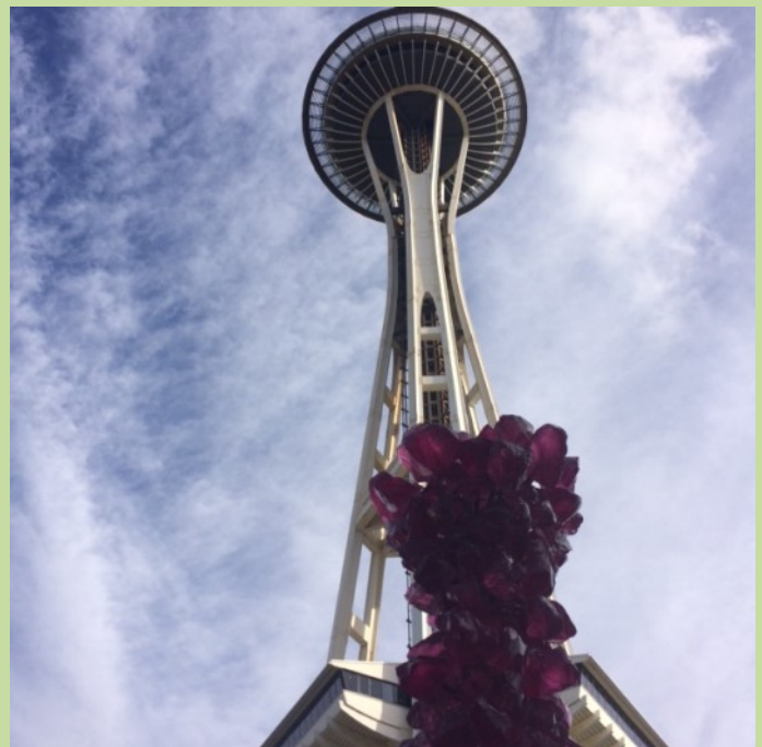
Chihuly Garden and Glass Exhibit in Seattle (near the Space Needle)