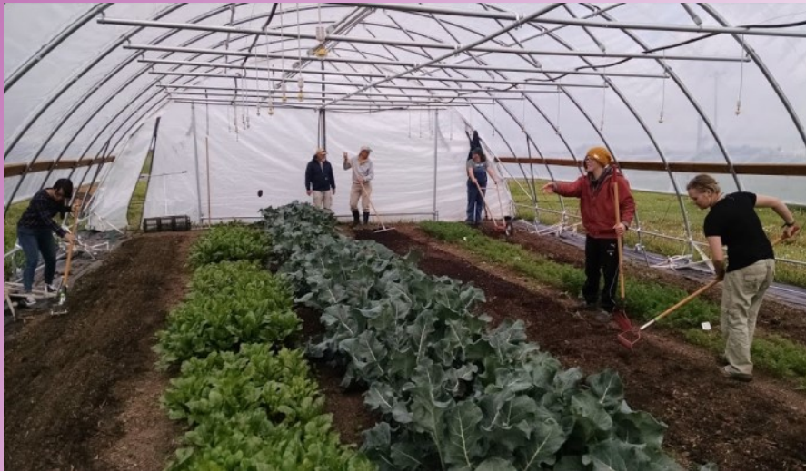
HORT 345 students seeding radish, salad turnips, and salad mix into one of the mobile high tunnels.

and transplanting methods. Students investigate the various direct market opportunities available to growers in the region as well as integrated pest management approaches to weeds, insects and diseases. New this year is a service learning component as the class has designed and installed the kitchen garden beds at HRDC's Community Café.