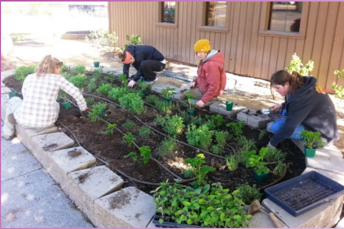
The HORT 345 class at work at the Community Café garden.