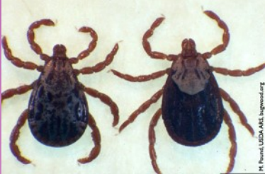
The female is on the right and the male is on the left.