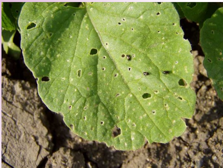
Flea beetle "shot holes" and adult beetles on radish

Why so many hosts? It is because there are several species of flea beetles that attack