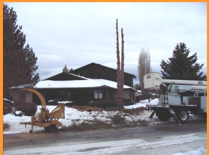
The cost of not protecting your trees