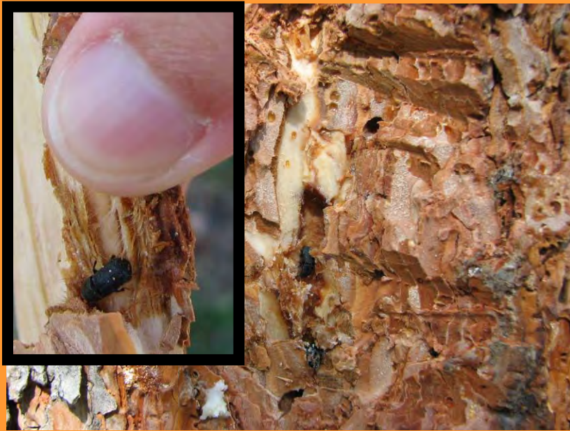
Adult mountain pine beetles under the bark of a Scots pine tree. These are tiny beetles not much larger than a grain of rice.

into carbon sources (Kurz et al., 2008; Nature, 452: 987-90).