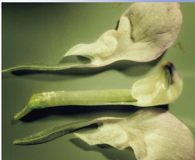
Photograph of a close-up of the flower detail of Vicia americana. The wing petals (top and bottom) enclose the keel (center), which in turn houses the reproductive parts. This floral morphology has a bilateral symmetry that is unique

Photographs of all of these species are taken so that the 3-dimensionality and close-ups of flowers, fruits, and other diagnostic traits can be readily accessed via a collection on www.flickr.com . These photographic collections include sets for local sites in Bozeman, such as Burke Park ( http://www.flickr.com/photos/plant_diversity/sets/72157620805880377/ ) and the Gallagator Trail ( http://www.flickr.com/photos/plant_diversity/sets/72157620806308215/ ). These photos are augmented by a collection of about 200 plants species given to the students during the semester. Students can opt to make a taxonomically organized reference collection from these specimens which can be taken with them at the end of the semester. Such a collection is, or should be, invaluable to those students working on aspects of Montana vegetation.