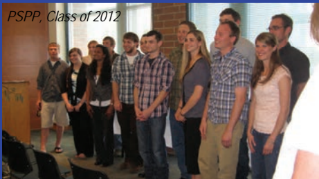
PSPP, Class of 2012