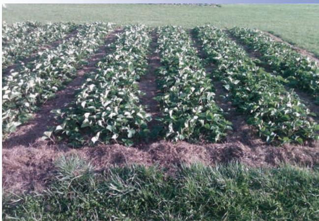
Typical "matted row" strawberry bed

Establish rows. The best strawberry beds are planted in matted rows with pathways in between, rather than having a large uncontrolled mess of a planting bed. Matted rows allow for easier picking and less competition between plants. Matted rows