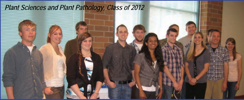
Plant Sciences and Plant Pathology, Class of 2012