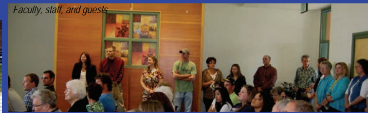
Faculty, staff, and guests