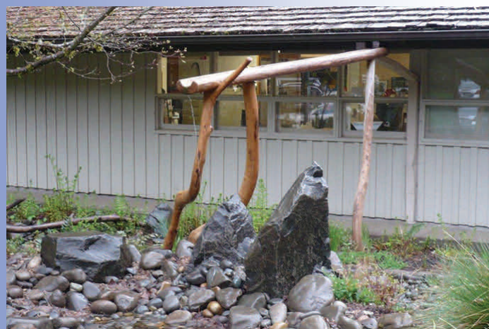
Creative rain spout built from natural products of the Oregon coast.