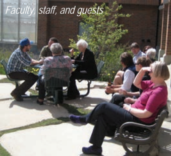
Faculty, staff, and guests