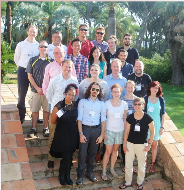
Participants of the MILAF workshop in Ste. Maxime, France

The lively discussions and brainstorming activities led the group to put together a vision for the direction of future research and public outreach concerning the impact of Ice Nucleating Bacteria in initiating rainfall. Several new collaborations are being established as a result of this workshop.