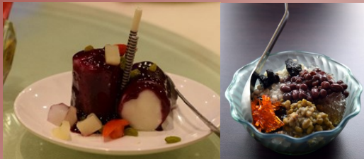
Blueberry paste on yam (Dioscorea), Ice "tea" from Taiwan (various foods on top of ice)