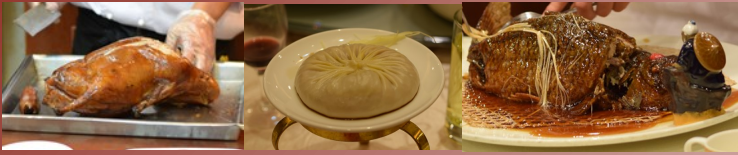
The Peking roast duck; Crab Soup Baozi; and, oh, that's the fish I caught ...