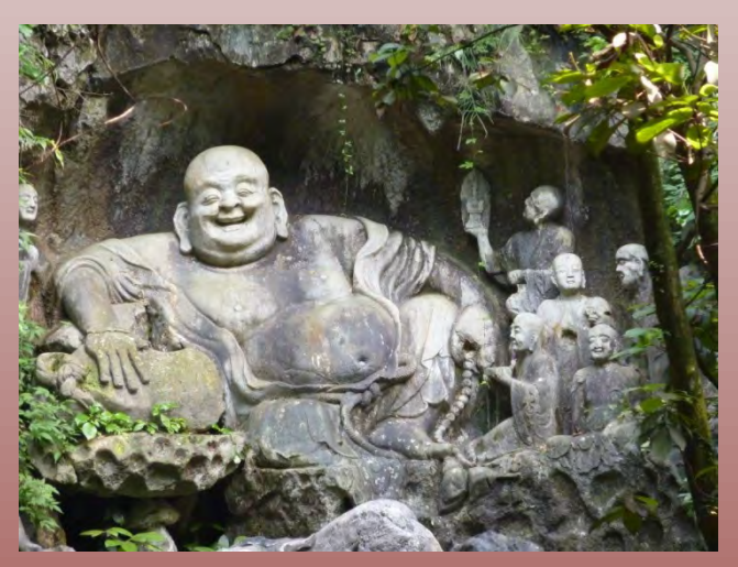
Lingyin Temple, Hangzhou. The Laughing Buddha.

From Shanghai we traveled to the resort city of Hangzhou known for its scenic beauty. In Hangzhou, we visited the Lingyin temple and monastery made up of palaces, pavilions, and pagodas. Lingyin was established in 328 AD and is now one of the largest Buddhist temples in China. The temple houses a collection of important pieces of Buddhist literature in the library and is home to over 3,000 Buddhist monks. All around the temple grounds there are carvings in the rock faces surrounded by lush gardens. One of the most famous carvings is that of the fat laughing Buddha.