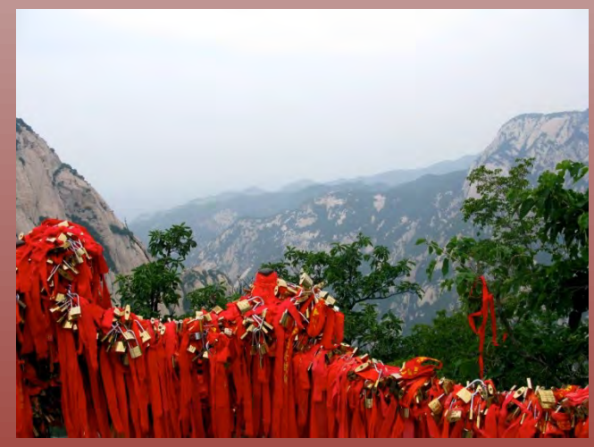
Hua Shan, Xi'an. The locks and read cloth left to represent a commitment made.

We rode the cable car to the base of the North Peak and then hiked to the summit. The railings along the trail were covered with gold locks and red cloth strips.