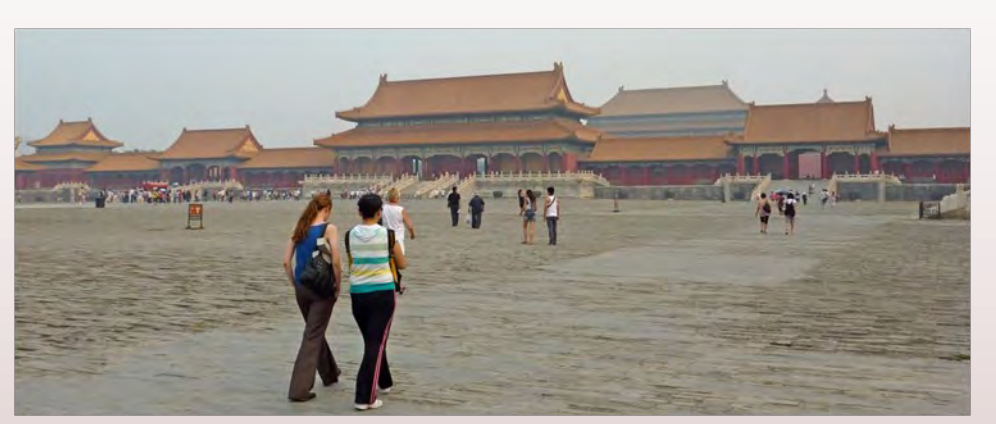
The Forbidden City, Beijing. L-R: Jackie Campbell and Apple

The Forbidden City was built in 1420 and served as the imperial palace from the Ming to Qing dynasties. It was reserved for the emperor and his household and served as the location for national ceremony and political gatherings. The 980 buildings of the Forbidden City are revered as a reflection of traditional Chinese architecture and aesthetics.