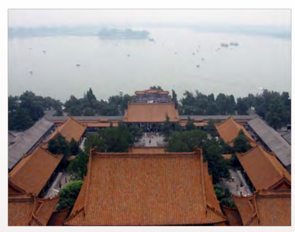
The Summer Palace, Beijing—view from the highest point at the Summer Palace