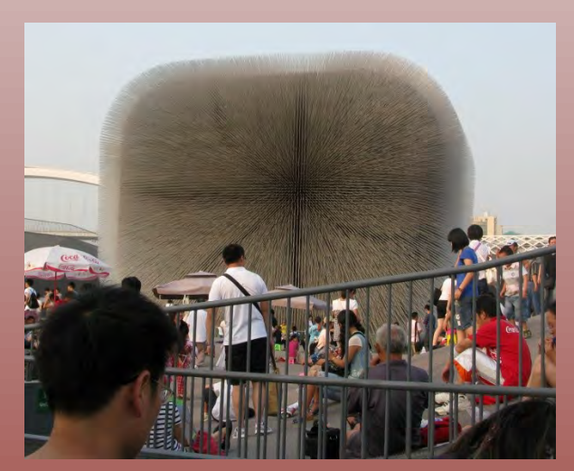
The World Expo, Shanghai. The UK pavilion

The World Expo is an international event of cultural exchange where countries prepare galleries and exhibits related to national art, design, education, trade, technology, and culture. Each participating country designs and constructs an enormous pavilion to house their gallery. The World Expo has received over 30 million visitors and will continue through October. The larger pavilions had waits up to six hours long! Instead of standing in line we appreciated the pavilions' exteriors. The most striking pavilion we saw was the UK's which looked like an exploding cube (photo20).