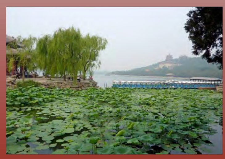
The Summer Palace, Beijing. The lotus pond on Kunming Lake.

The Summer Palace, "The Garden of Nurtured Harmony", was originally built in 1750 but was re-built as it stands today in the late 1800's. It served as a place for relaxation and meditation for the emperor. The palace complex contains many gardens, pavilions, halls, temples, and bridges, all surrounding Kunming Lake.