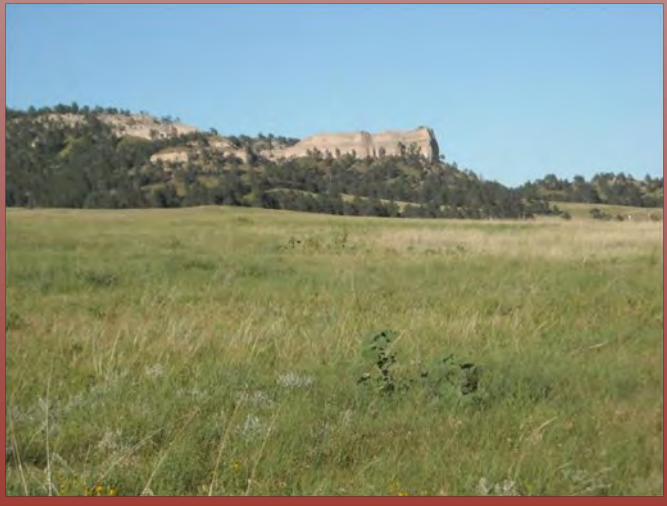
The view from Ft. Robinson in Western Nebraska

Our entire group went to Fort Robinson for a hay ride and cook out. This is a beautiful area in Western Nebraska. The fort was important in the Indian Wars. It was the home of Red Cloud of the Ogalala and the Red Cloud Agency and is where Crazy Horse surrendered and was killed. The fort was important during WWII for dog training as well as soldiers. It also served as a remount station. As the Army dismounted, the horses and mules were shipped here and eventually dispersed. The area is well worth a visit and is a great place to camp, especially with a horse.