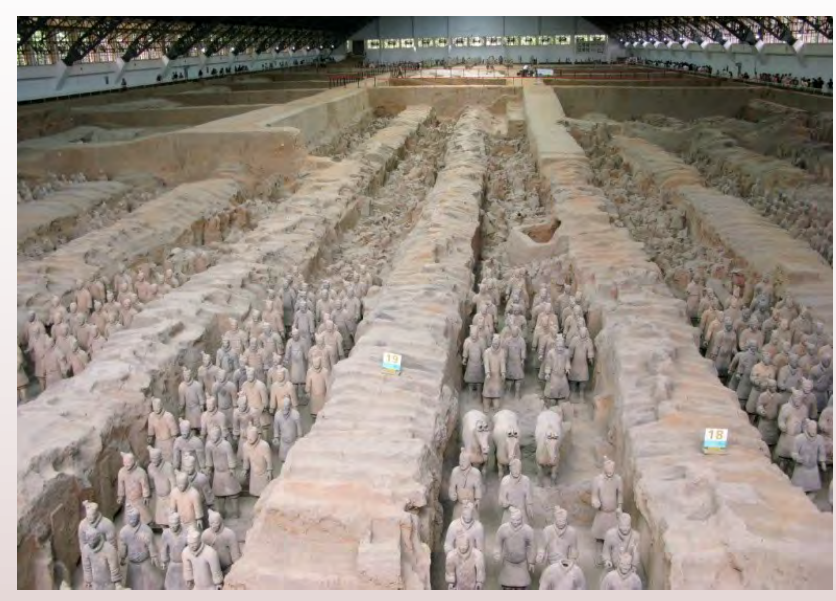
Terra Cotta Army, Xi'an. One of the three pits on site.

well. It is estimated there are over 8,000 unique clay statues but the exact number is unknown as not all of the pits have been excavated.