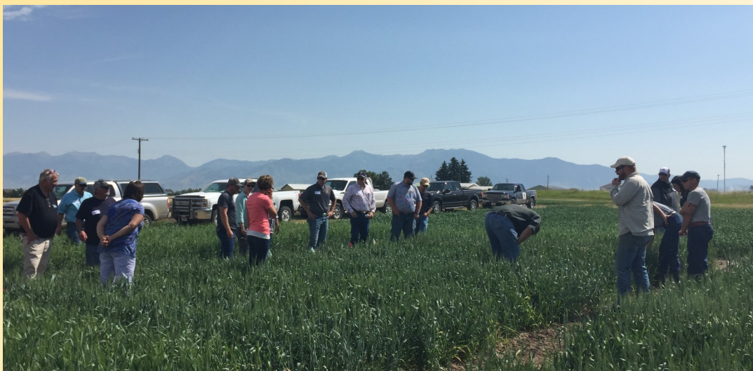
Participants scout for field diseases at the Post Farm.