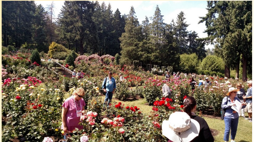
Conference attendees at the International Rose Test Garden, Portland, OR

The one tour I was able to attend was the Three Iconic Gardens tour which included the Portland International Rose Test Garden, the