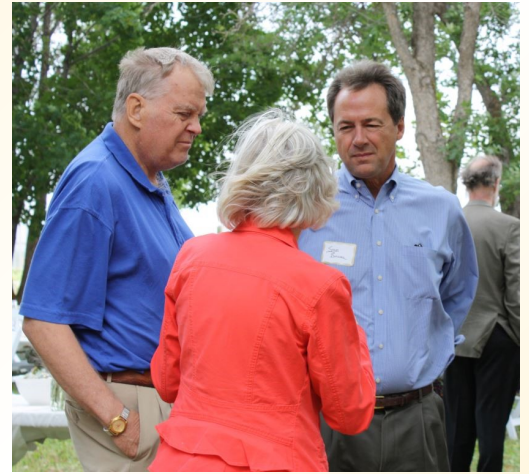
Governor Seve Bullock with lunch guests.

visit Towne's Harvest Garden and see the hard work these students have put in over the summer.