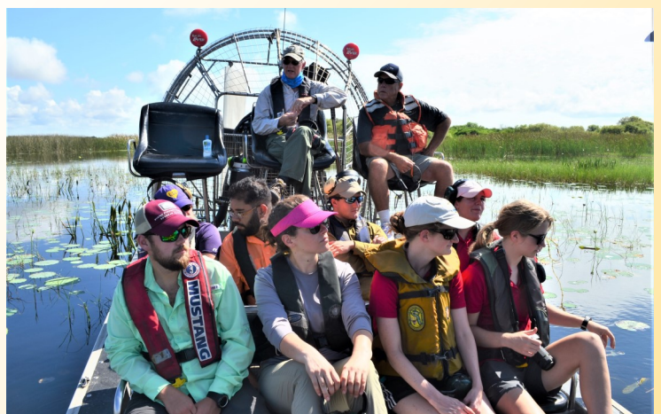
Graduate students taking a tour of Lake Tohopekaliga.

After the conference, graduate students were taken on a guided tour of Lake Tohopekaliga