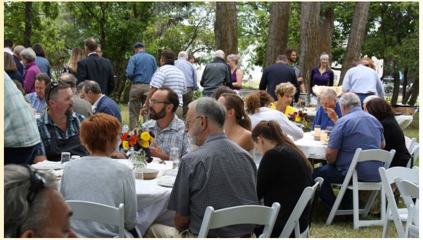
President's Lunch in the grove of the Horticulture Farm.