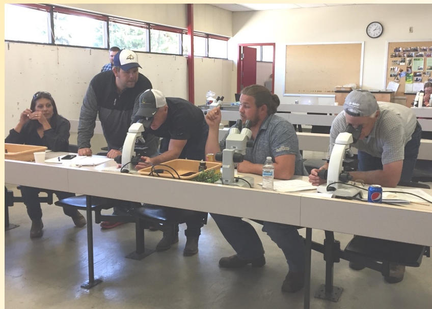
Advance Diagnostics Workshops included preparation and diagnosis of diseased samples collected in the field.