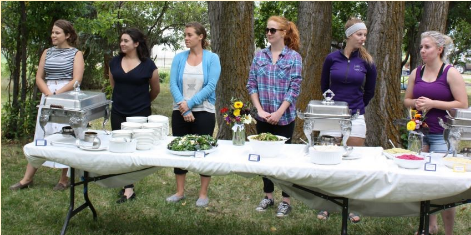
Culinary Marketing students with the dishes they prepared.