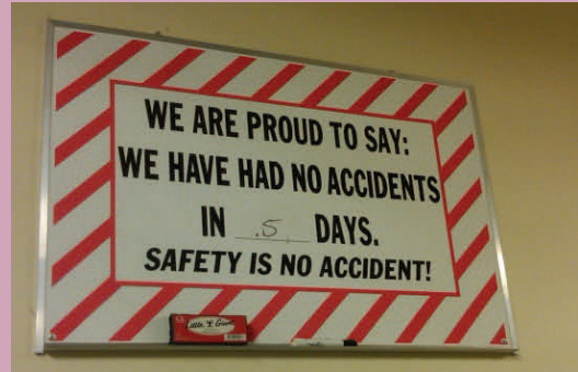
We wore our safety glasses here...

The best part of this meeting is the local ag tour. In Boise, we visited the Water Center, where we saw a massive stream replicator that researchers use to model different things including the composition of mud