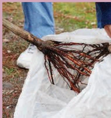
Bare root tree.