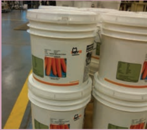
Carrot seed, anyone?

MRLs (maximum residue limits) to facilitate trade with international partners. The issue is that many of our trading partners have lower thresholds for pesticide residue in grain than the U.S. If enforced, this results in rejection of grain that was raised according to the U.S. label but does not meet the standard of the importing country. IR-4 has also expanded into the human health arena, facilitating registrations of public health pesticides (mainly mosquito controls).