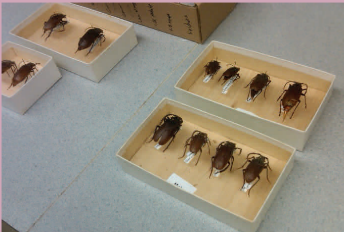
I'm hoping the Montana hops growers never have to deal with this one – California prionus (Prionus californicus Motschulsky (Coleoptera: Cerambycidae)