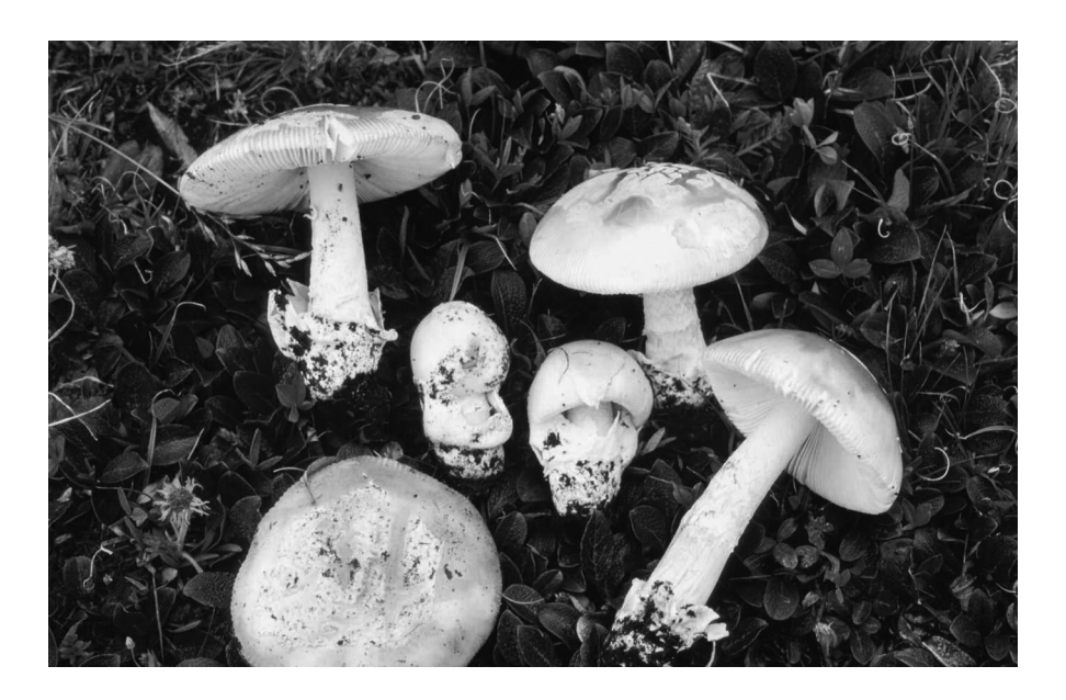
Fig. 3. Amanita absarokensis (sp.n., ad int). from the Beartooth Plateau in MT/WY, Rocky Mountains, USA. It is close to A. groenlandica but differs by a more salmon-colored pileus, velar tissue which does not gray on drying, a less viscid pileipellus and taller stature.

It appears close to A. groenlandica Bas ex Knudsen & T. Borgen (1987) from which it differs by a pale orange pileus and velar material that does not gray on drying. In aspect, it is also taller and less squat than A. groenlandica . Microscopic characteristics are similar to A. groenlandica with globose spores 9.5-11(12) \times 10-12(13) \mu m and filamentous velar tissue with some sphaerocysts present. It is significantly more robust than the arctic-alpine fungus A. nivalis .