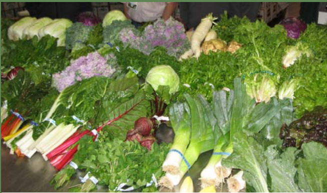
A sample of the vegetables being shipped by Ratto Bros.