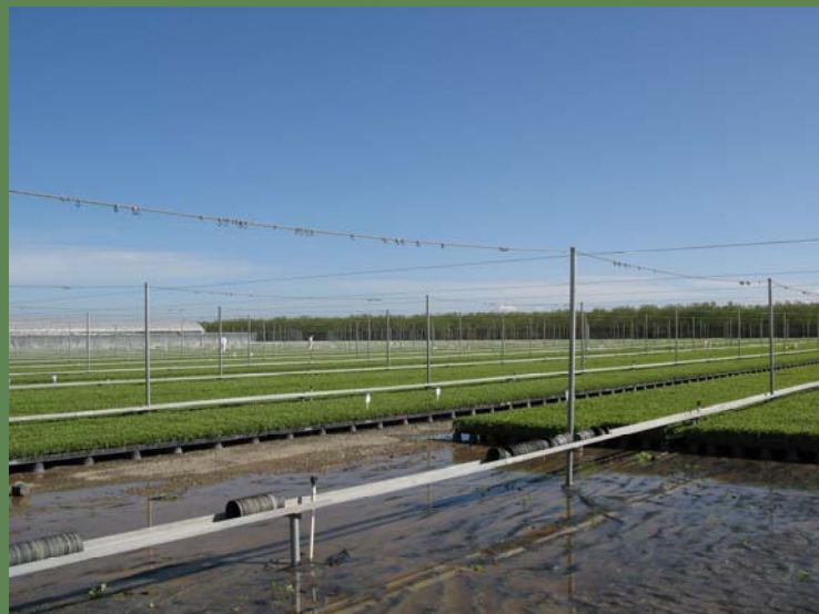
Tomato transplants at Masterplant

One way IR-4 has helped Montana is by requesting the registration of Poast (sethoxydim) for weed control in camelina. EPA is currently reviewing this request, and will have a decision by September, 2008 at the latest. The IR-4 Project coordinated with the Montana Department of Agriculture, Montana State University, BASF, commodity groups and the EPA to put the petition together. Estimates of potential economic loss without the use of IR-4 based section 18s in Montana from 1998-2005 is $165,000,000.