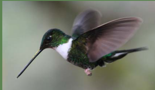
The Buff -Tailed Coronet hummingbird of Ecuador

Imagine yourself trying to drive on this scary road between Cuenca and Guayaquil Ecuador.