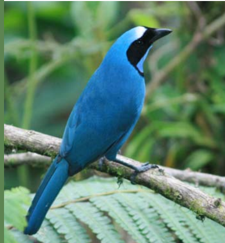
The Masked Flower Piercer of the Ecuadorian cloud forest

Overall the trip was productive in that many photos and plant samples were acquired. New friends were made and the sights, sounds and wonders of a new place were experienced. Such opportunities should be