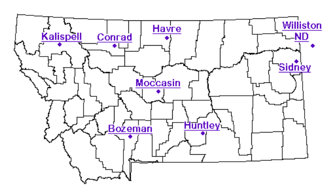
Fig. 1. Test Locations for Montana winter wheat performance tests in 2014.